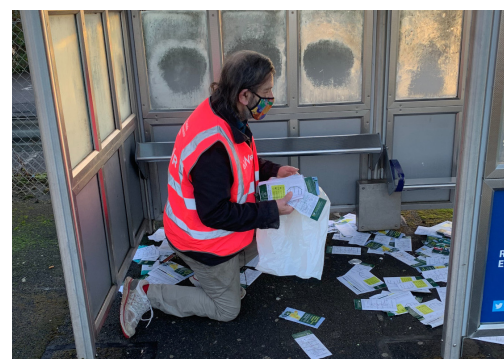
“Melksham Litter Picking” posted on 12th April 2021