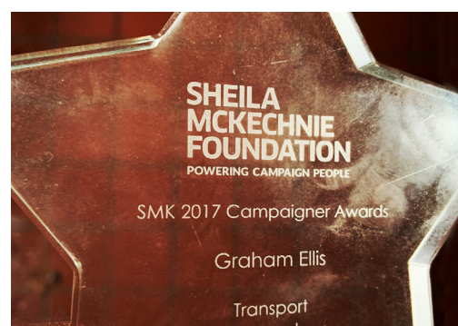
“Campaigning in Partnership” posted on 6th April 2021