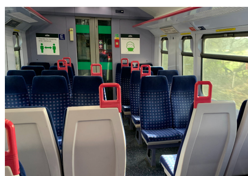
“From Two Empty Trains to Nine Busy” posted on 7th April 2021