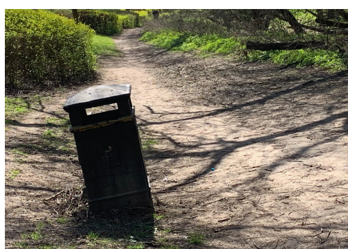
“Do We Need More Rubbish Bins?” posted on 5th April 2021