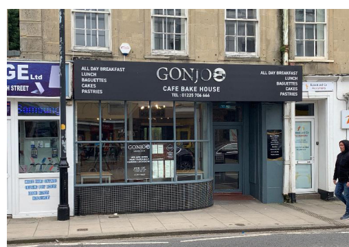
“Melksham Town Centre” posted on 4th April 2021