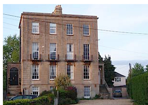
“Restoring Old Buildings” posted on 31st March 2021