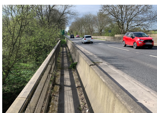
“Making it Walkable” posted on 8th April 2021