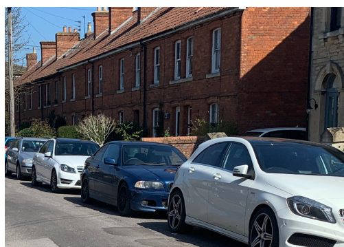
“Big Changes - Electric Car Charging” posted on 11th April 2021