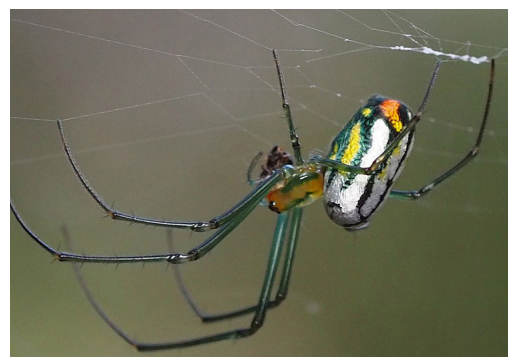
“Overcome Political Hurdles - Persist” posted on 13th April 2021

These are my views about what a town councillor should stand for, be and do. They are what I will stand for if elected for the south ward of Melksham on 6th May 2021.