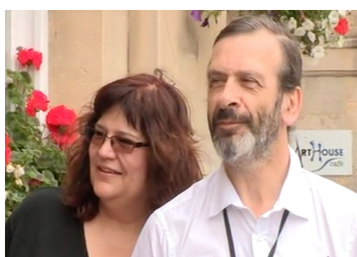
“Four in a Bed” posted on 1st April 2021