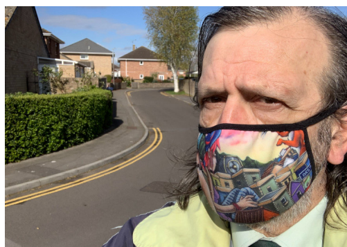
“School Pick-ups and Drop-offs” posted on 14th April 2021