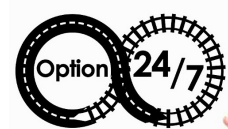
“Growing Need for Public Transport” posted on 15th April 2021