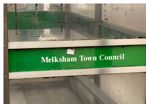
“Online Answer Questions” posted on 9th April 2021